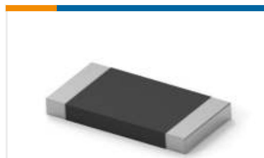
TE Part #1-2176421-9 TLRP 2512 2.0W R022 1% 25PPM 4K RL