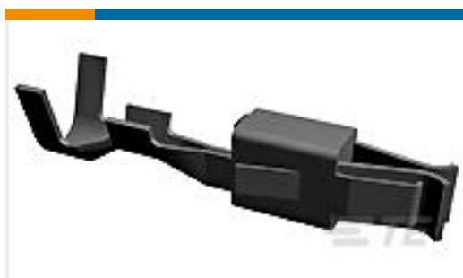
TE Part #1-929939-1 JPT REC 2.8 Contact SWS Au