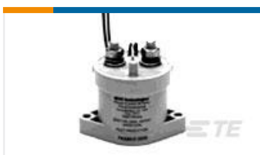
TE Part #1-1618002-8 EV200HAANA=RELAY, SPST-NO WITH