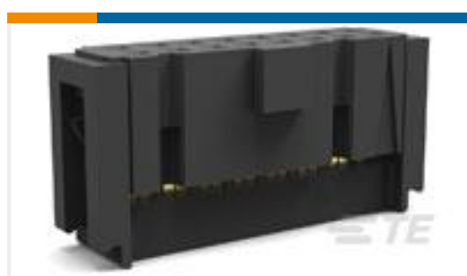
TE Part #1-1658527-0 622-2641LF FEM SOCKET, LEAD FREE