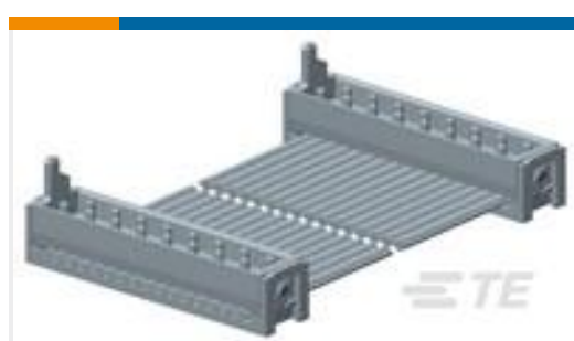
TE Part #1483356-1 MICRO-MATCH LEAD 16P 100MM