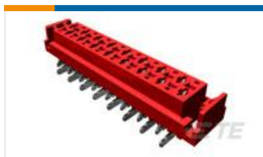
TE Part #8-338069-6 MICRO-MATCH SMD FTE