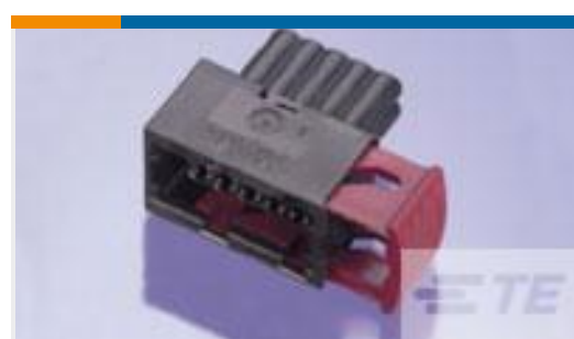
TE Part #1-963212-1 6P J-P-T GEH KOMPL