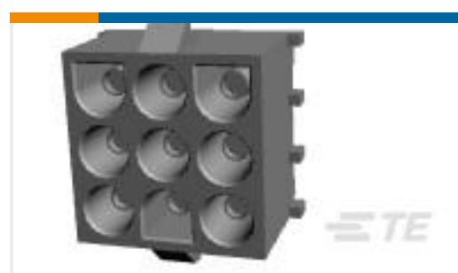
TE Part #350835-4 09P UMNL HDR ASSY PC 94VO LF