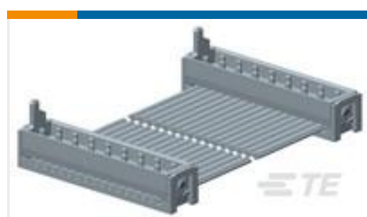
TE Part #1483356-2 MICRO-MATCH LEAD 16P 150MM