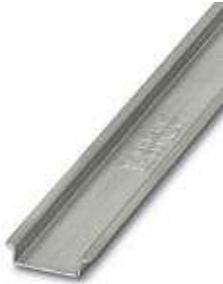
DIN rail, material: Steel, unperforated, height 7.5 mm, width 35 mm, length: 2 m

Please be informed that the data shown in this PDF Document is generated from our Online Catalog. Please find the complete data in the user's documentation. Our General Terms of Use for Downloads are valid ( http://phoenixcontact.com/download )