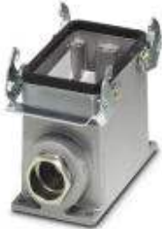
The illustration shows version HC-D 50-SFQD-97/O 1 M 25

Box mounting base, for double locking latch, height 81 mm, with screw connection, 1x Pg29