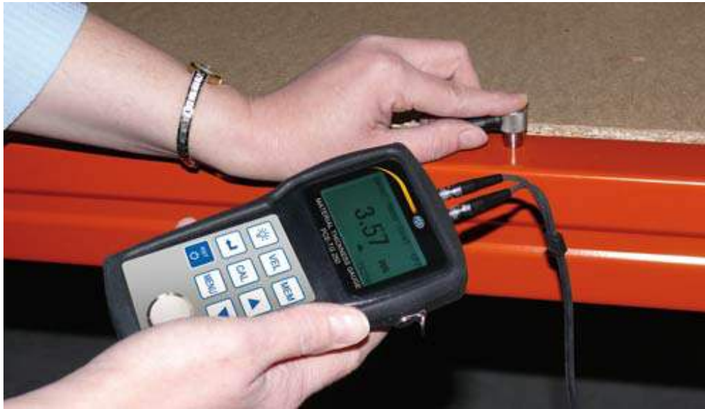
Here is the PCE-TG 250 in use