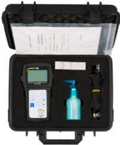
Here is the PCE-TG 250 thickness gauge in its case.