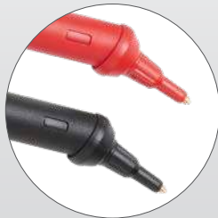
BTL20ANG Angled Measurement Probes