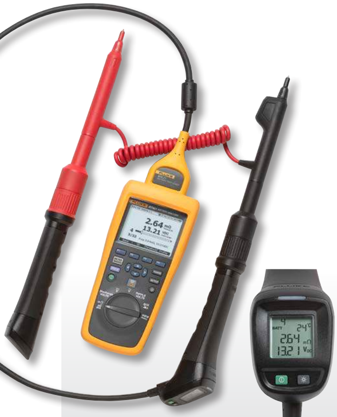
Intelligent test probe with integrated LCD display