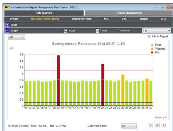
Histogram of a battery string with user defined threshold.