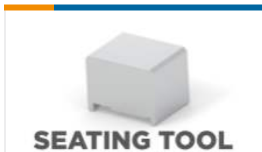
TE Part # 2018381-1 TOOL, SEAT 3 PR 16 COL, BP CONN