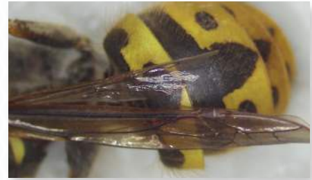
Excellent Color Reproduction