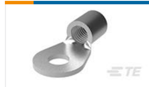
TE Part #2-321298-6 TERM,SOLIS RING #6 10