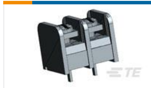
TE Part #3-1437664-0 NC6-P108-02=NC6 ASSEMBLY