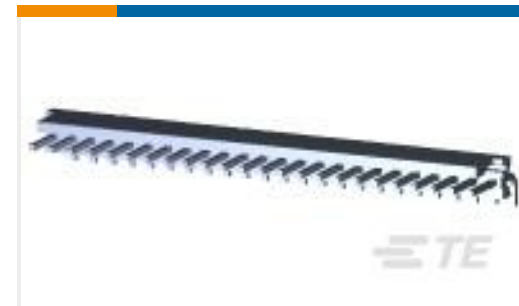
TE Part #2-640389-4 24P MTA156 HDR ASSY SQ R/A F/L