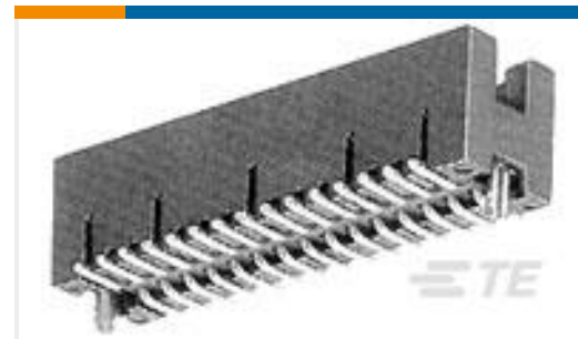
TE Part #5-104655-9 80 50/50 HDR DRST SFMNT TIN