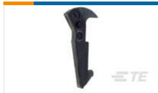
TE Part #102320-1 UNIVERSAL HEADER LATCH