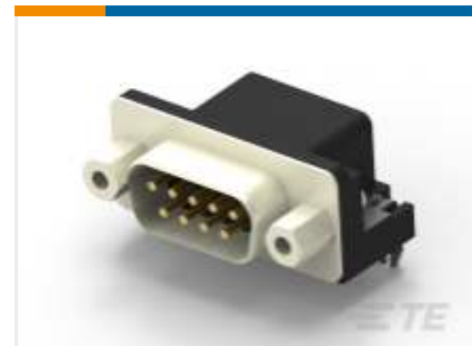
TE Part #2301843-2 AMPL PLUG HD20, R/A, 9P, B/L, 4-40 S /LOCK