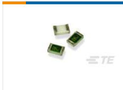
TE Part #5-1879337-5 CPF 0603 9K09 1% 50PPM 1K RL