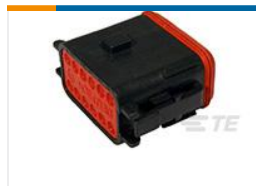
TE Part #DT06-12SB-P012 PLG, 12P, BLK, N, SEAL RET, ENH KEY, B