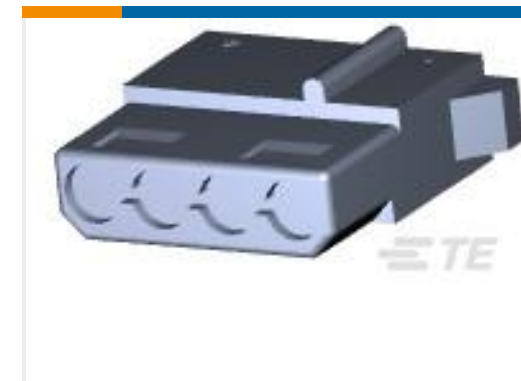
TE Part #1-480424-0 04P CMNL PLUG HSG F/H NATL