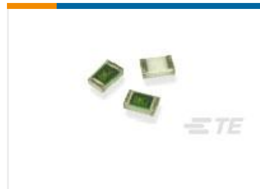
TE Part #1676232-2 RN 0805 1K43 0.1% 10PPM 1KRL