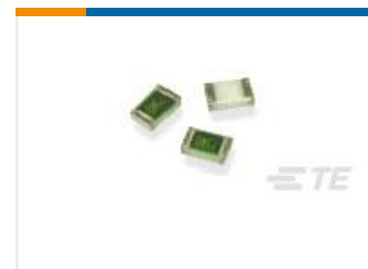
TE Part #1676153-2 RN 0805 10K 0.1% 10PPM 1KRL