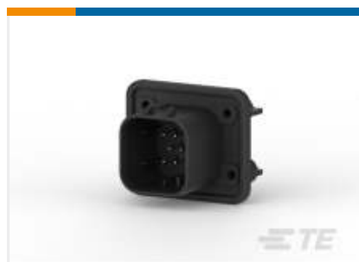
TE Part #776266-1 AMPSEAL PCB Horizontal Headers