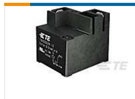
TE Part #1-1393210-8 T9AS1D12-24