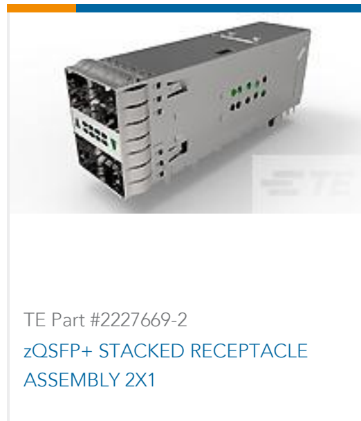
TE Part #2227669-2 zQSFP+ STACKED RECEPTACLE ASSEMBLY 2X1