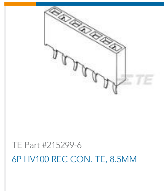
TE Part #215299-6 6P HV100 REC CON. TE, 8.5MM