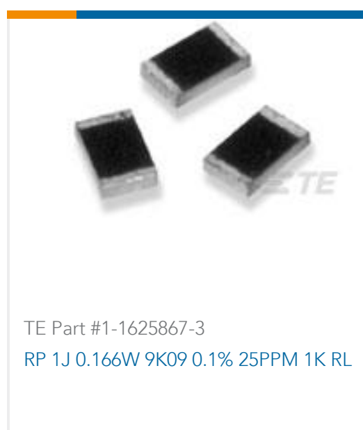
TE Part #1-1625867-3 RP 1J 0.166W 9K09 0.1% 25PPM 1K RL