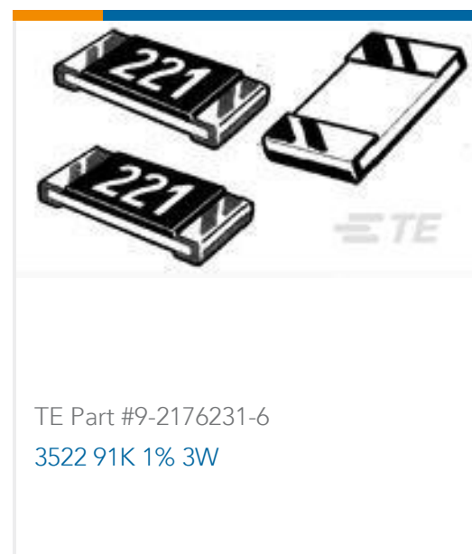
TE Part #9-2176231-6 3522 91K 1% 3W