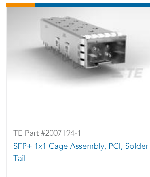
TE Part #2007194-1 SFP+ 1x1 Cage Assembly, PCI, Solder Tail