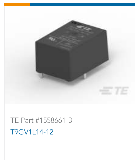
TE Part #1558661-3 T9GV1L14-12