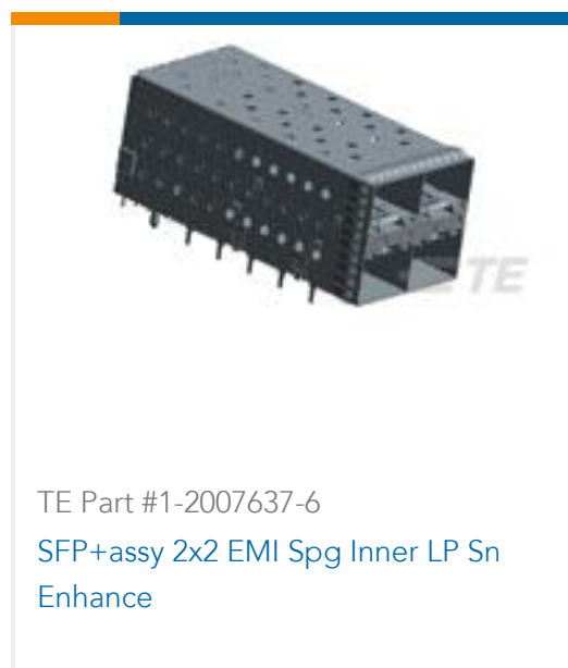
TE Part #1-2007637-6 SFP+assy 2x2 EMI Spg Inner LP Sn Enhance