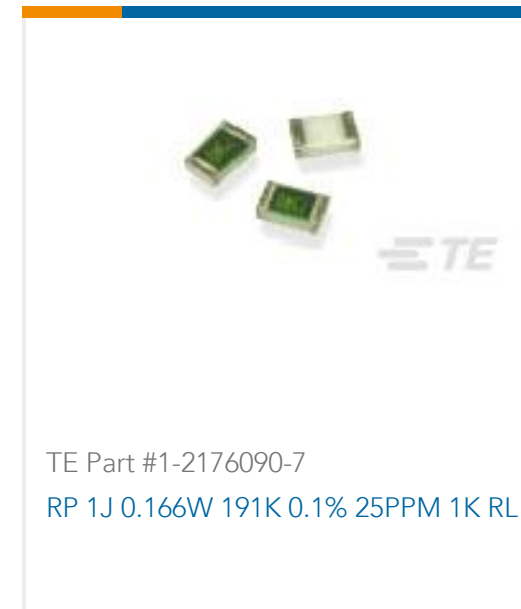
TE Part #1-2176090-7 RP 1J 0.166W 191K 0.1% 25PPM 1K RL