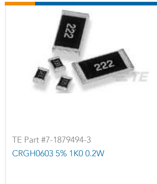
TE Part #7-1879494-3 CRGH0603 5% 1K0 0.2W