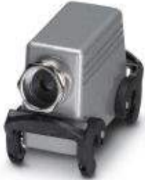
Hood, with double locking latch, height 65 mm, with screw connection, 1x Pg21, lateral cable entry

Please be informed that the data shown in this PDF Document is generated from our Online Catalog. Please find the complete data in the user's documentation. Our General Terms of Use for Downloads are valid ( http://phoenixcontact.com/download )