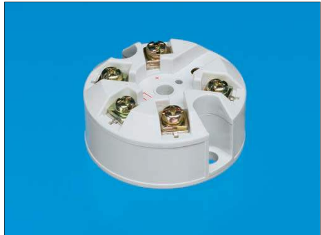
Push Button Temperature Transmitter

A complete data sheet with input and output specifications is available by contacting SS&C Engineering.