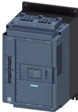
SIRIUS soft starter 200-600 V 63 A, 24 V AC/DC spring-type terminals Thermistor input