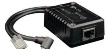
POE-MSPLT-48xxP PoE Converter/Splitter

The POE-MSPLT-48xxP-F is a unique splitter with dual outputs. It accepts 802.3af or 802.3at PoE and provides 48V PoE and 48V or 24V or 12VDC outputs concurrently so two separate devices can be powered. The DC output is provided on a standard 5.5mm/2.1-2.5mm barrel connector and the Data/PoE output is provided on standard RJ45 network connector, each on a 6" cable. The DC connector is compatible with Tycon passive PoE injectors like POE-INJ-1000-S for ease of integration. In addition to being compatible with 10/100MB Ethernet speeds, inputs and outputs are isolated and the devices include protections for short circuit and overload.