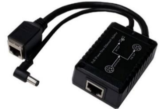
POE-MSPLT-48xxP-F PoE Converter/Splitter