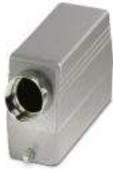
Sleeve housing, for single locking latch, height 76 mm, without screw connection, 1x Pg29, lateral cable entry

Please be informed that the data shown in this PDF Document is generated from our Online Catalog. Please find the complete data in the user's documentation. Our General Terms of Use for Downloads are valid ( http://download.phoenixcontact.com )