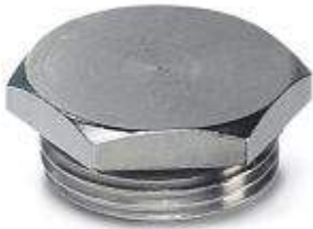
Filler plug, metal, size: M40

Please be informed that the data shown in this PDF Document is generated from our Online Catalog. Please find the complete data in the user's documentation. Our General Terms of Use for Downloads are valid ( http://download.phoenixcontact.com )