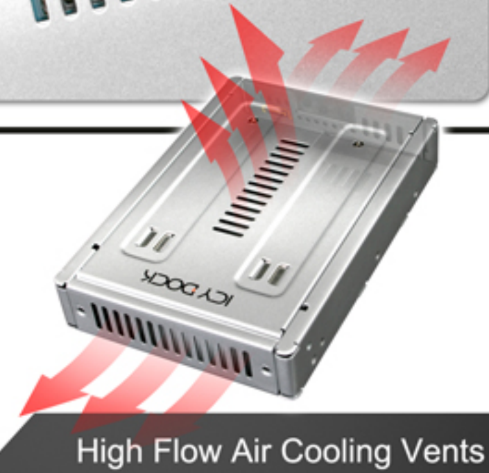
High Flow Air Cooling Vents