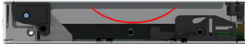
Smart-Fit Anti-Vibration (With 15mm Drive)