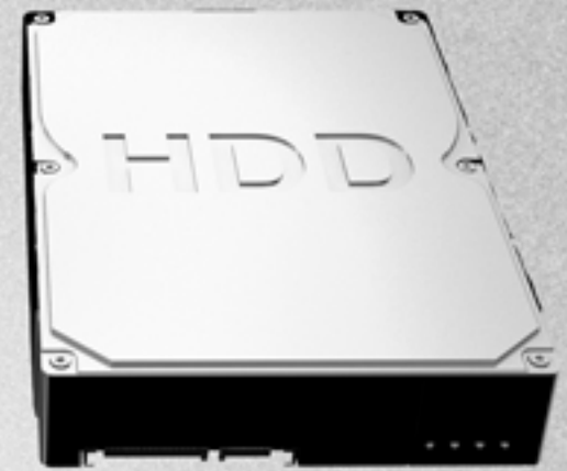
Exact Specifications of Standard 3.5" Hard Drive