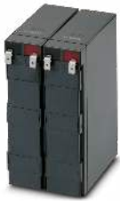
Replacement battery for UPS-BAT/VRLA... energy storage

Please be informed that the data shown in this PDF Document is generated from our Online Catalog. Please find the complete data in the user's documentation. Our General Terms of Use for Downloads are valid ( http://phoenixcontact.com/download )