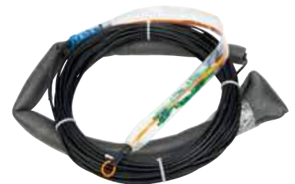
3M™ External Cable Assembly Module (ECAM) Factory Terminated Fiber Cable Assembly (FCA)