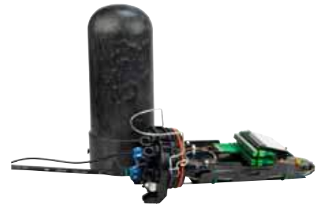
3M™ Fiber Dome Stubbed Terminal FDST 08S

The FDST 08S terminal features a fixed O-ring sealing system along with an innovative latching mechanism. This combination provides simple, virtually error-free terminal sealing and re-entry. Also, the re-entry feature allows easy access to clean and repair connectors and replace the terminal or terminal tail in the event that either of these are damaged.