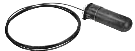
3M™ Fiber Dome Stubbed Terminal FDST 08S