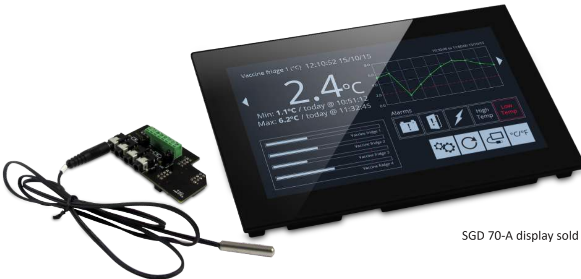
SGD 70-A display sold separately

S70-TP is a four-channel thermistor board to add temperature measurement functionality to the SGD 70-A PanelPilotACE display. Within the PanelPilotACE Design Studio software users can choose to display, log or graph the temperature inputs.