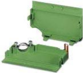
Cable housing, Pitch: 0 mm, Number of positions: 14, Dimension a: 70 mm, Color: green

Please be informed that the data shown in this PDF Document is generated from our Online Catalog. Please find the complete data in the user's documentation. Our General Terms of Use for Downloads are valid ( http://download.phoenixcontact.com )