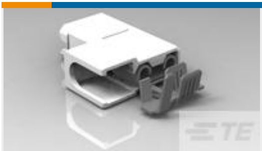
TE Part #521282-2 ULTRA-POD 250 ASSY REC 18-14 AWG TPBR