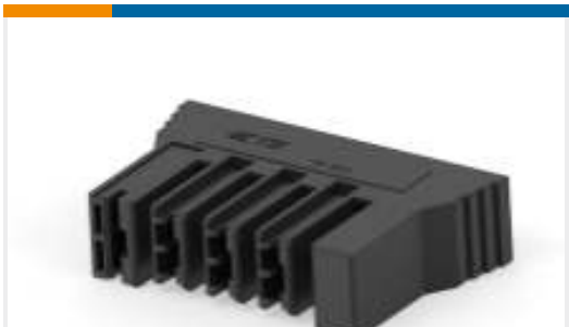
TE Part #1969898-1 250 & 187 FASTON HSG.,REC.,4 POS, BLACK