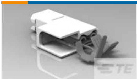
TE Part #521599-2 ULTRA-POD 187 ASY REC 18-14 TPBR