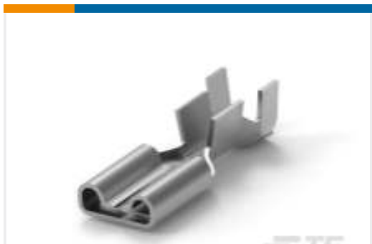
TE Part #2238207-3 187 FASTON,REC.,20-16 AWG,TPBR