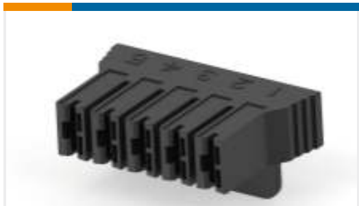
TE Part #1969897-1 250 FASTON HSG.,REC.,5 POS,BLACK