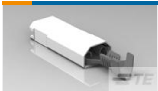
TE Part #521367-2 ULTRA-POD 250 ASSY REC 18-14 AWG TPBR