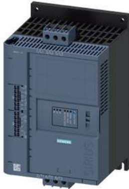
SIRIUS soft starter 200-480 V 38 A, 110-250 V AC spring-type terminals Thermistor input