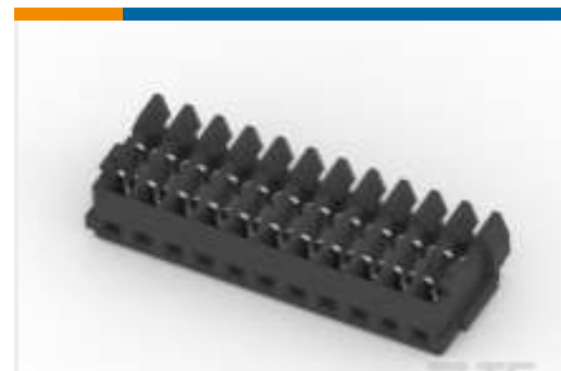
TE Part #3-353293-1 1.5MM CT MT REC ASSY 11P BLACK