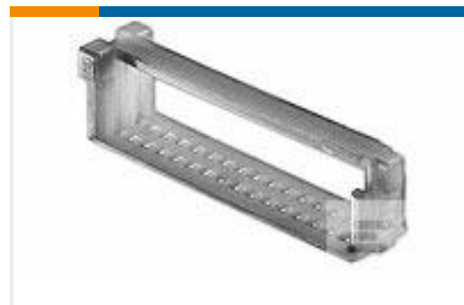
TE Part #2-353294-2 AMP MINI D/R HDR HSG 22P NATU