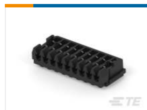
TE Part #2-353293-9 1.5MM CT MT REC ASS'Y 9P BLACK