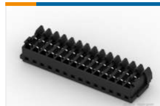
TE Part #3-353293-4 1.5MM CT MT REC ASSY 14P BLACK