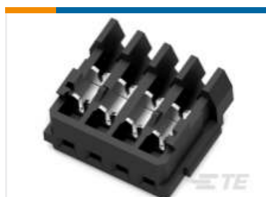
TE Part #2-353293-4 1.5MM CT MT REC ASS'Y 4P BLACK