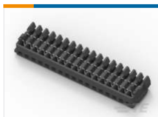
TE Part #3-353293-7 1.5MM CT MT REC ASSY 17P BLACK