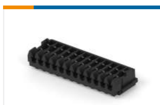
TE Part #3-353293-2 1.5MM CT MT REC ASSY 12P BLACK