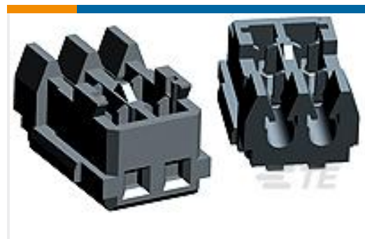
TE Part #353293-6 MINI CT MT REC ASSY 6P GRAY