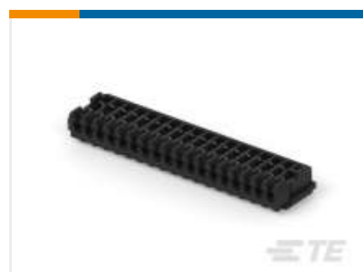
TE Part #3-353293-8 1.5MM CT MT REC ASSY 18P BLACK