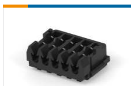
TE Part #2-353293-5 1.5MM CT MT REC ASS'Y 5P BLACK