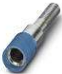
Female test connector, color: blue

Female test connector - PSBJ 4/15/6 BU - 0303354