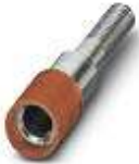
Female test connector, color: red

Female test connector - PSBJ 4/15/6 RD - 0303325