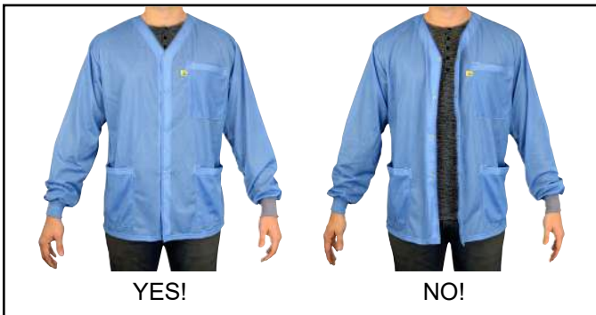
Figure 3. Proper wear of the Dual-Wire Static Control Smock