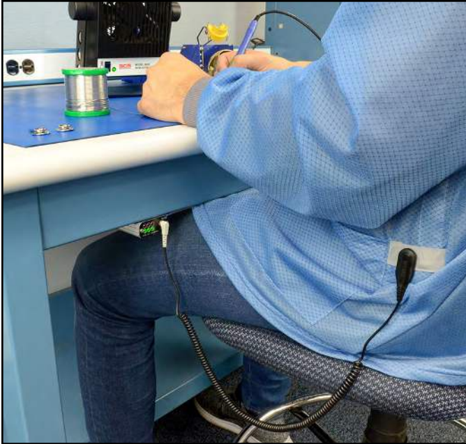
Figure 6. Using the Dual-Wire Static Control Smock with the SCS CTC331-WW Iron Man® Plus Workstation Monitor