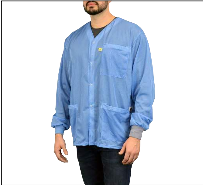
Figure 1. SCS Dual-Wire Static Control Smock