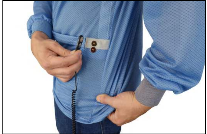
Figure 5. Connecting the SCS MagSnap® Dual-Wire Coil Cord to the Dual-Wire Static Control Smock