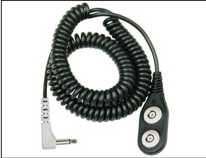
Figure 2. SCS 770110 MagSnap® Dual-Wire Coil Cord