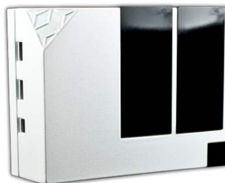
Argos 3D - P100

Using active IR illumination, the sensor is able to capture 3D and 2D information at a resolution of 160 x 120 pixels with up to 160* frames per second independently of ambient light. With a range of up to 3m, a field of view of 90° and a size of only 75 x 57 x 26 mm, this USB connected sensor can be used for next generation systems in various application fields like robotics, gesture recognition, HMI or people counting.