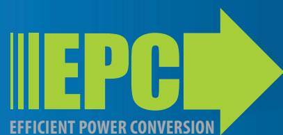
Table data subject to change. Please refer to the Product section on www.epc-co.com