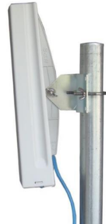
EZ-Bridge® AC tool-less installation