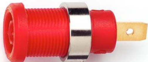
Model 72913 Panel Mount IEC61010 4mm (0.16in) Jack for Sheathed Banana Plugs

Panel Mt IEC61010 4mm (0.16in) Jack for Sheathed Banana Plugs