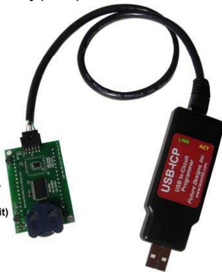
Example User Target Board (Not Part of Kit)

The ISP function uses only six pins: VCC, GND, RXD, TXD, PSEN- and RESET. The simple circuit above is all that must be added to the user’s application to use ISP with USB-ICP.