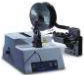
Electrical crimping tool

Electrical crimping tool - SF-Z0032 - 1607462