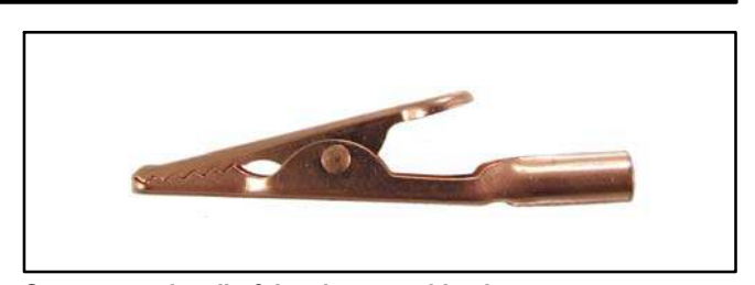
See page 17 for clip & insulator combinations.