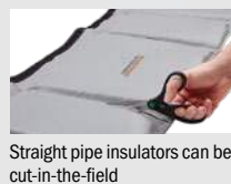
Straight pipe insulators can be cut-in-the-field