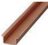
DIN rail, material: Copper, unperforated, 1.5 mm thick, height 15 mm, width 35 mm, length: 2 m

DIN rail - NS 35/15 CU UNPERF 2000MM - 1201895