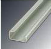
G rail 32 mm (NS 32)

DIN rail - NS 32 AL UNPERF 2000MM - 1201028