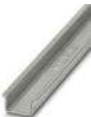
DIN rail, material: Steel, unperforated, 2.3 mm thick, height 15 mm, width 35 mm, length: 2 m

DIN rail - NS 35/15-2,3 UNPERF 2000MM - 1201798