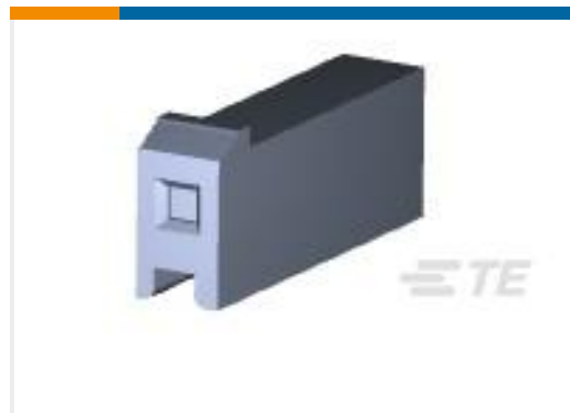
TE Part #640250-1 01P SL156 HSG W/LCK RAMP NATL