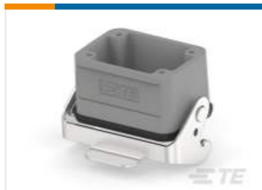
TE Part #T1730060000-000 H6B-TBF-T