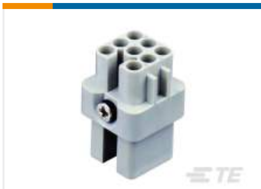
TE Part #T2020082201-000 HD-008-F