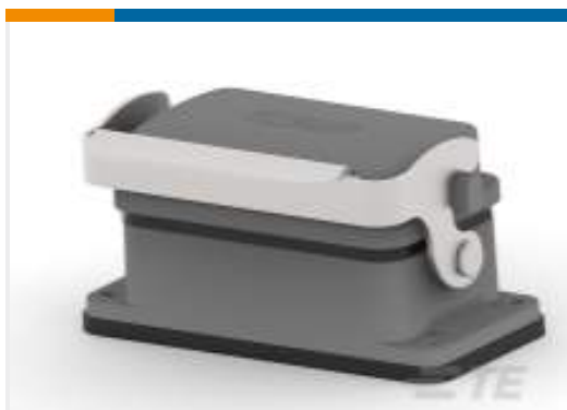
TE Part #T2120100220-000 ZGGP-H10BSK 1-7/2-8/3-9/4-6/5-10