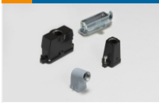
Rectangular Connector Hoods & Bases (1258)