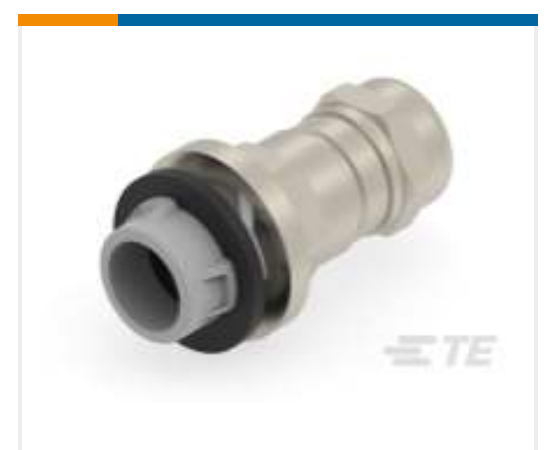
TE Part # 1SNG623006R0000 EM-SIG-SZ20-MET-C