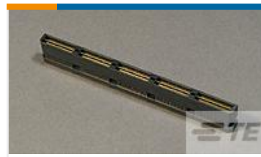
TE Part # 1658439-5 MSB0.80PL14ASY200FL,-,30,-TY