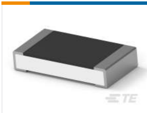
TE Part #4-2176391-7 RQ 1206 37K4 0.1% 10PPM 5K RL