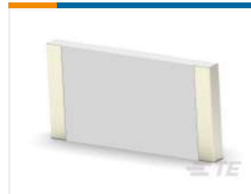
TE Part #7-2176246-6 CRGS2512 5% 1M8