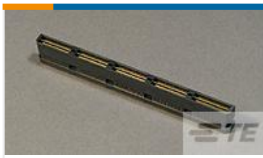
TE Part # 1658437-5 MSB0.80PL14ASY200FL,-,F,-TY