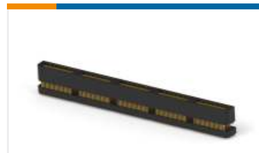
TE Part # 1658438-5 MSB0.80PL14ASY200FL,-,10,-TY