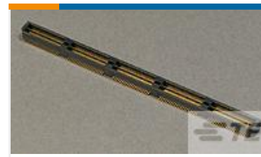
TE Part # 1658463-5 MSB0.80PL5ASY200FL,-,30,-TY