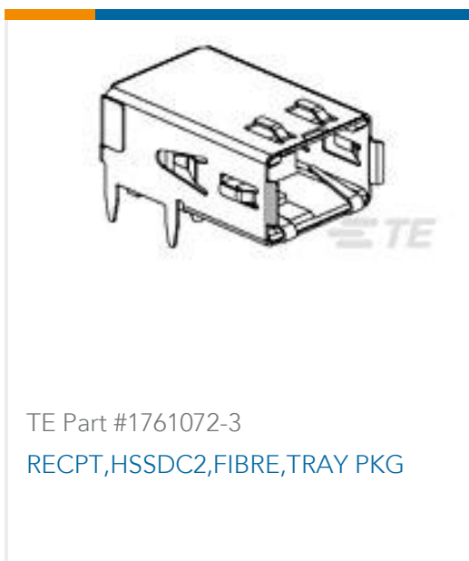
TE Part #1761072-3 RECPT,HSSDC2,FIBRE,TRAY PKG