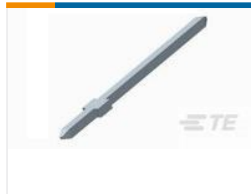
TE Part #1-928836-2 MOD2 PIN WITH A-PIN L/P