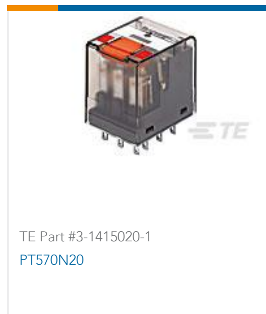
TE Part #3-1415020-1 PT570N20