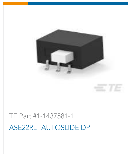
TE Part #1-1437581-1 ASE22RL=AUTOSLIDE DP