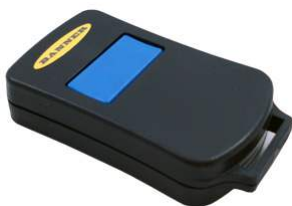
Model Number: BWA-MGFOB-001

The optical commissioning device is a LED flashlight used to change the radio's modes. A radio can be put into sleep mode, taken out of sleep mode, or put into binding mode.