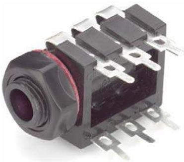
Model 7160 Horizontal 3-Conductor Jack, Solder Tabs