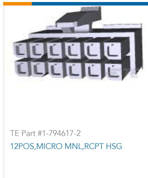
TE Part #1-794617-2 12POS,MICRO MNL,RCPT HSG