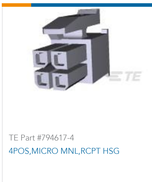
TE Part #794617-4 4POS,MICRO MNL,RCPT HSG