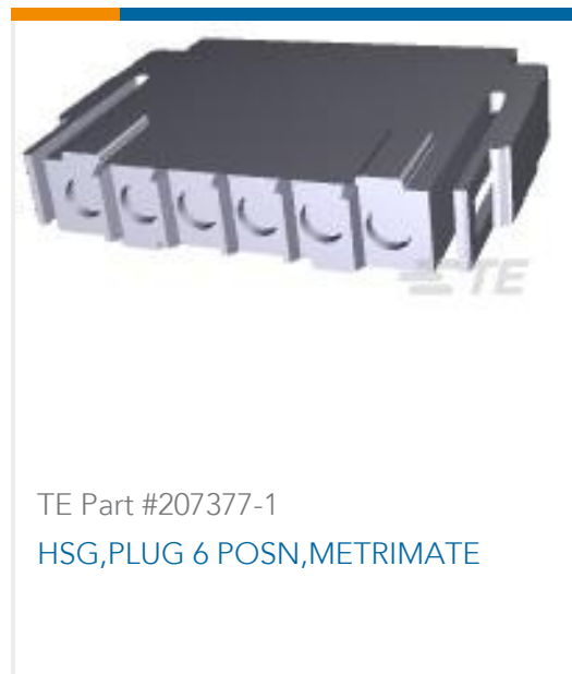
TE Part #207377-1 HSG,PLUG 6 POSN,METRIMATE