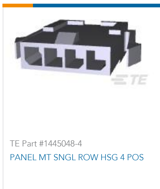
TE Part #1445048-4 PANEL MT SNGL ROW HSG 4 POS