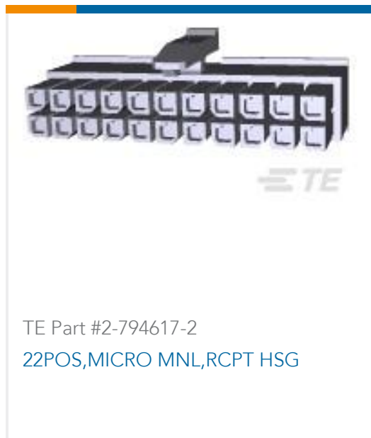
TE Part #2-794617-2 22POS,MICRO MNL,RCPT HSG