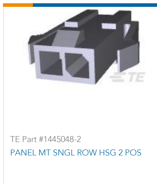
TE Part #1445048-2 PANEL MT SNGL ROW HSG 2 POS