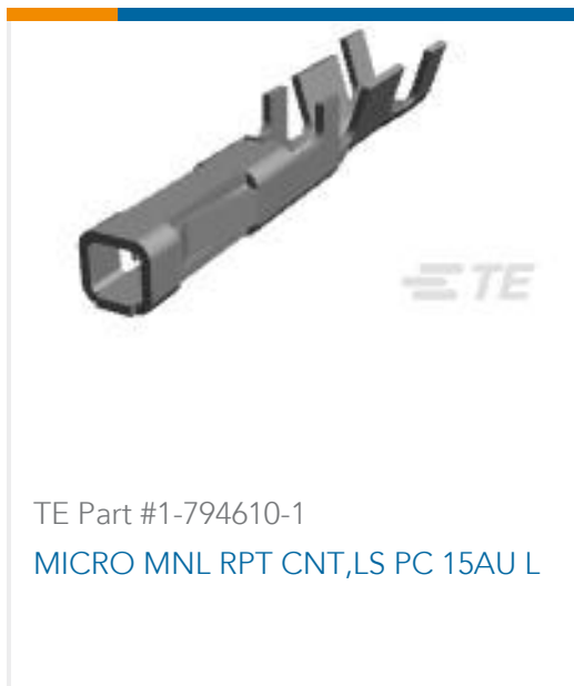
TE Part #1-794610-1 MICRO MNL RPT CNT,LS PC 15AU L