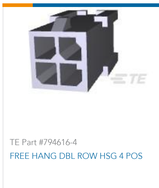
TE Part #794616-4 FREE HANG DBL ROW HSG 4 POS