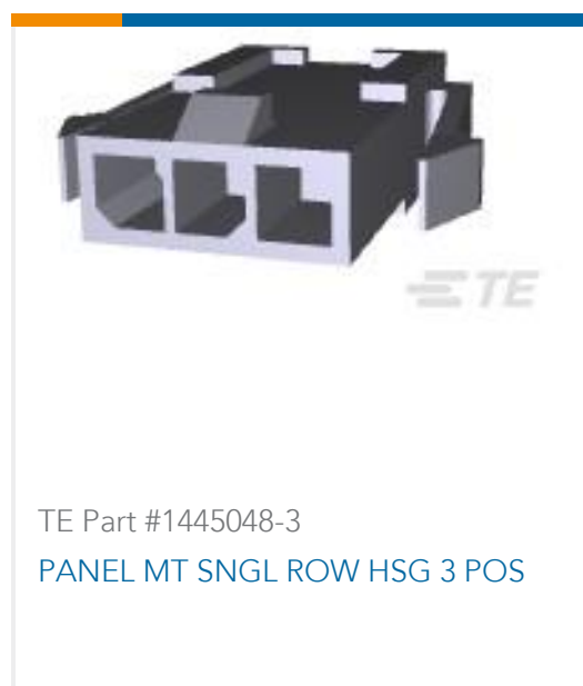
TE Part #1445048-3 PANEL MT SNGL ROW HSG 3 POS