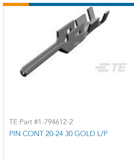
TE Part #1-794612-2 PIN CONT 20-24 30 GOLD L/P