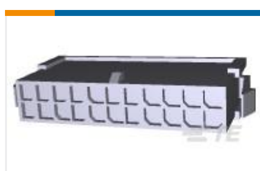
TE Part #2-794615-2 PANEL MT DBL ROW HSG 22 POS