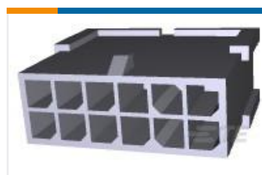
TE Part #1-794616-2 FREE HANG DBL ROW HSG 12 POS