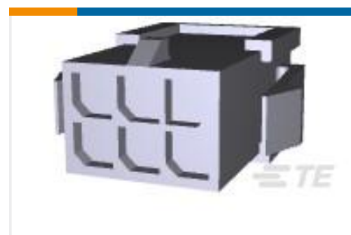
TE Part #794615-6 PANEL MT DBL ROW HSG 6 POS