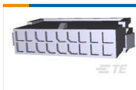
TE Part #1-794615-8 PANEL MT DBL ROW HSG 18 POS