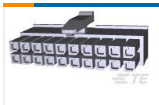
TE Part #2-794617-0 20POS,MICRO MNL,RCPT HSG