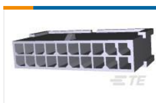
TE Part #2-794616-0 FREE HANG DBL ROW HSG 20 POS