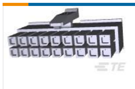
TE Part #1-794617-8 18POS,MICRO MNL,RCPT HSG