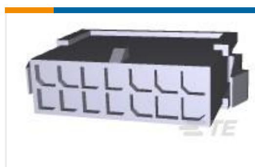
TE Part #1-794615-4 PANEL MT DBL ROW HSG 14 POS