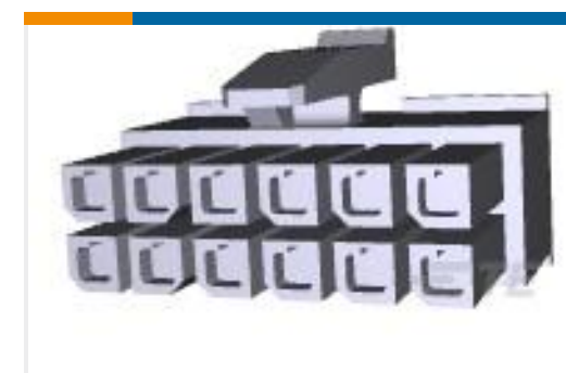
TE Part #1-794617-2 12POS,MICRO MNL,RCPT HSG