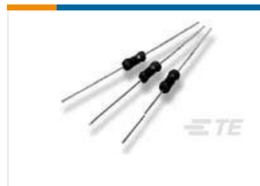
TE Part #9-1879352-1 RR02 5% 1K8 AMMO