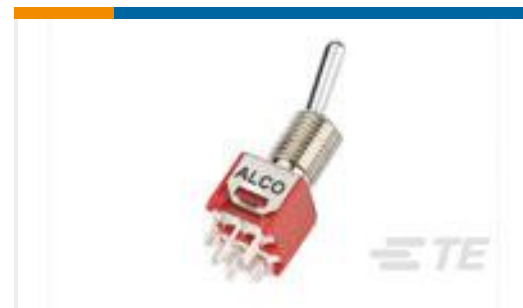
TE Part #2267077-1 TMS1T4B5M2RE