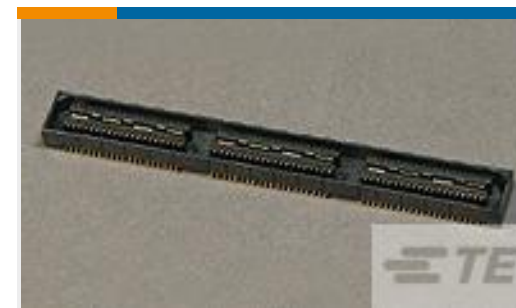
TE Part #2-1658012-3 MSB0.80RC-ASY120FL,-,10,-TY