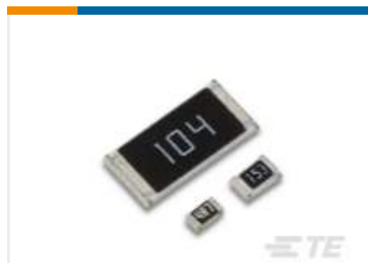
TE Part #2176347-6 CRGCQ 2010 27R 1%