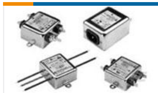
TE Part #1-6609027-5 10EK7=F7095 S0