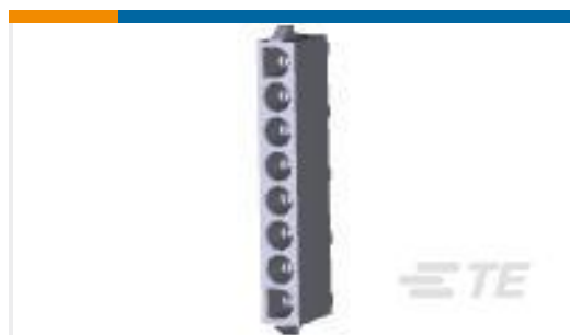
TE Part #643410-1 08P UMNL PIN HDR ASSY POL 94VO