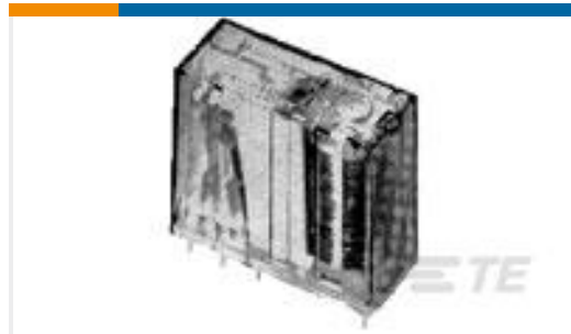
TE Part #1-1393258-5 V23047-A1024-A501