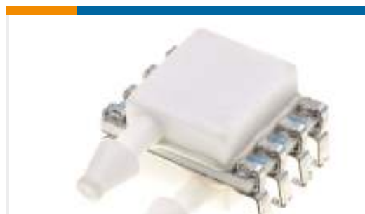
TE Part #4525-DS5B001DSF PRESS XDCR, ANALOG, PSI RANGE