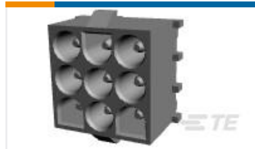
TE Part #350432-4 09P UMNL PIN HDR ASSY NATL LF