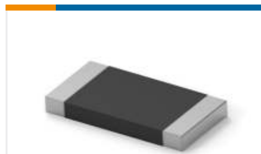
TE Part #9-2176422-0 TLRP 2512 3.0W R050 1% 75PPM 4K RL