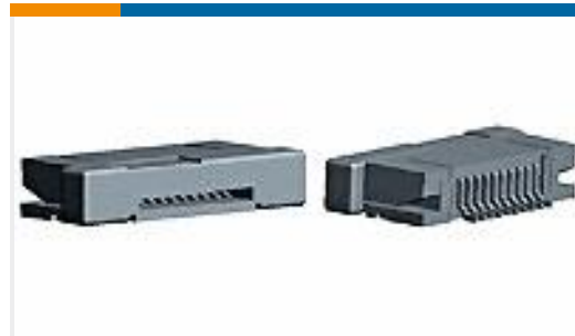
TE Part #1-1734592-2 FPC CONN. 0.5MM PITCH B/C, 12P