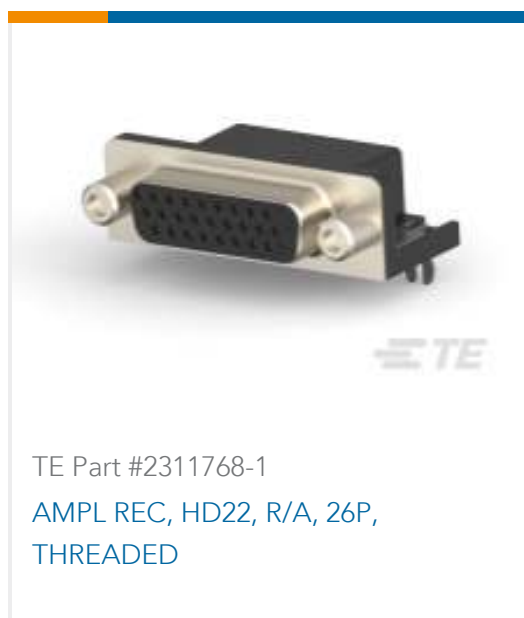
TE Part #2311768-1 AMPL REC, HD22, R/A, 26P, THREADED