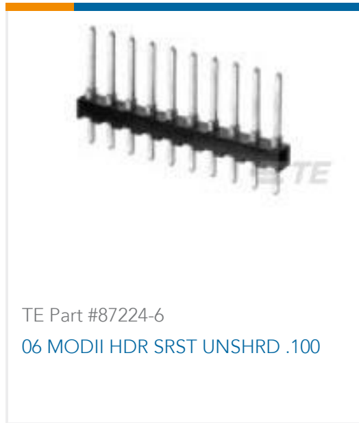
TE Part #87224-6 06 MODII HDR SRST UNSHRD .100