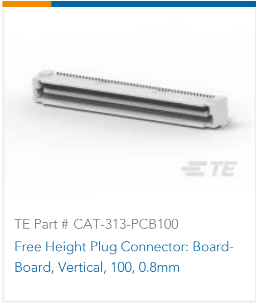
TE Part # CAT-313-PCB100 Free Height Plug Connector: Board-Board, Vertical, 100, 0.8mm