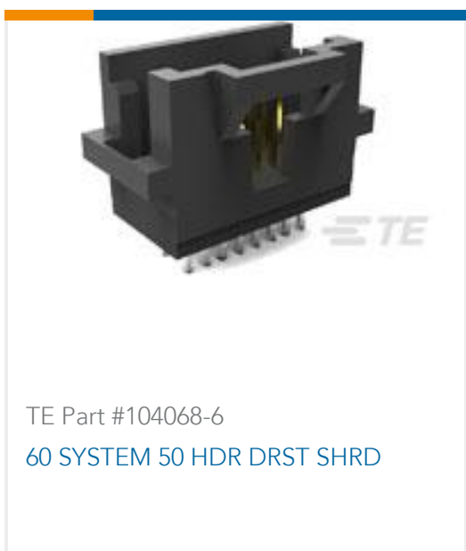
TE Part #104068-6 60 SYSTEM 50 HDR DRST SHRD