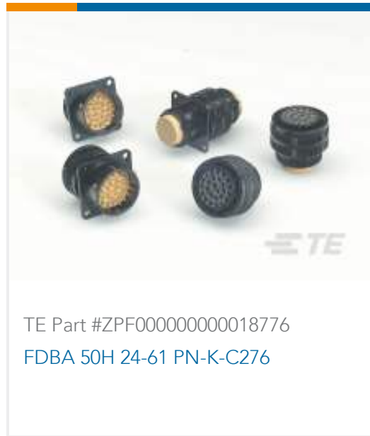
TE Part #ZPF00000000018776 FDBA 50H 24-61 PN-K-C276