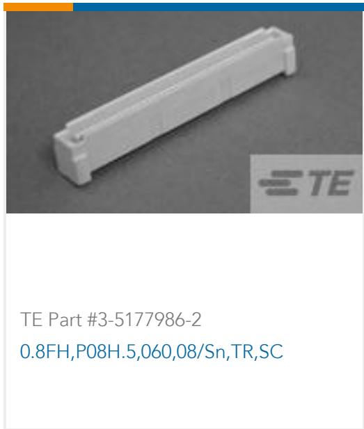
TE Part #3-5177986-2 0.8FH,P08H.5,060,08/Sn,TR,SC