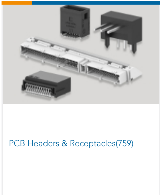
PCB Headers & Receptacles(759)