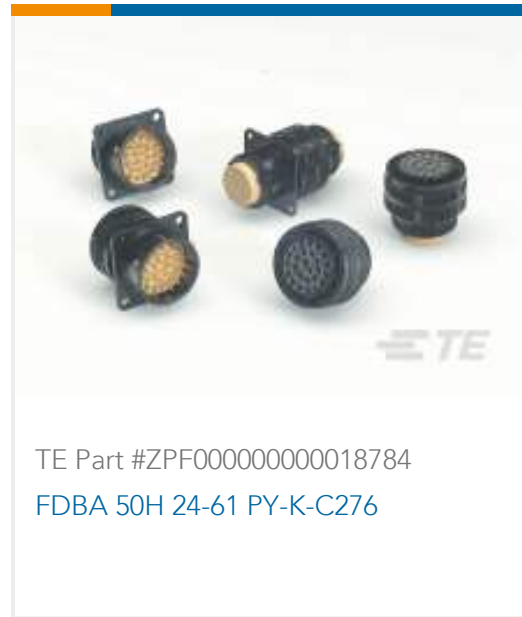
TE Part #ZPF00000000018784 FDBA 50H 24-61 PY-K-C276