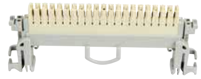
3M™ Disconnection Module STG2 C2

The 3M™ Switching Module (“normally opened”) STG2 O2 provides a connection that can only be made by insertion of a test cord, patch cord or a protector. It is typically used as a flexible connection point with patch cords or a safety connection point which allows isolation of the line when the protector is removed.