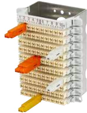
3M™ High Density Cross-Connect Module STG2000 100-pair block with single pair protectors