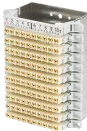
3M™ High Density Cross-Connect Module STG2000 in a 100-pair block configuration

The 3M STG2000 modules feature 3M IDC technology which offers reliable performance for mechanical wire retention, multiple re-terminations, and environmental protection to gas-tight connection. The modules can connect solid copper conductors in a range of diameters from 26 (0.4 mm) to 20 AWG (0.8 mm) with a maximum insulation sheath of 15 AWG (1.5 mm).