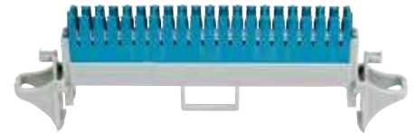
3M™ Switching Module STG2 O2