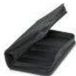
Tool box, empty

Tool bag - TOOL-KIT STANDARD EMPTY - 1212423