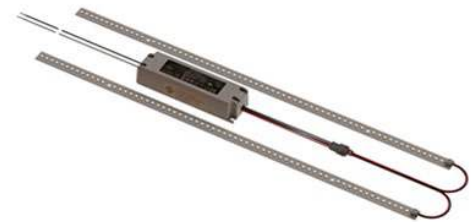
Converts 2 ft. by 2 ft. fixtures

RKS Universal Fluorescent Fixture Retrofit Kit. Easily converts most all your existing residential and commercial 4 and 8-foot T5, T8 and T12 linear fluorescent light fixtures into an integrated LED light fixture. This retrofit kit works with the earliest to the latest versions of ceiling mount, 4-foot and 8-foot fluorescent light fixtures, regardless of the style, manufacturer or existing ballast type including linear highbay, strip or wrap fixtures and even chain suspended shop lights.