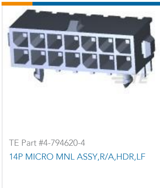
TE Part #4-794620-4 14P MICRO MNL ASSY,R/A,HDR,LF