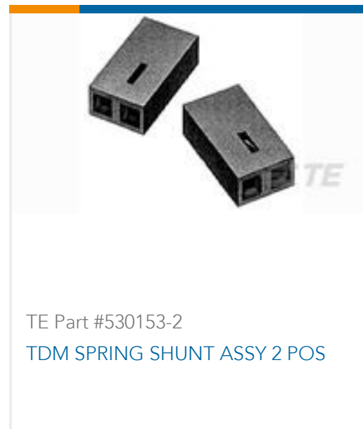
TE Part #530153-2 TDM SPRING SHUNT ASSY 2 POS