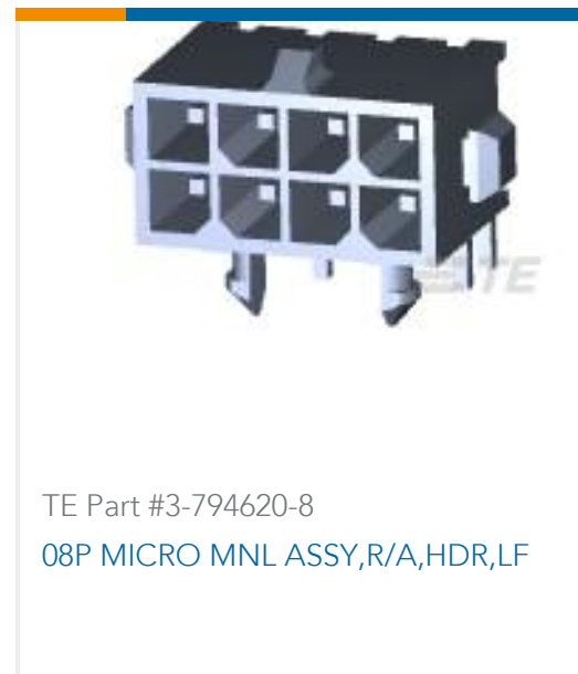
TE Part #3-794620-8 08P MICRO MNL ASSY,R/A,HDR,LF