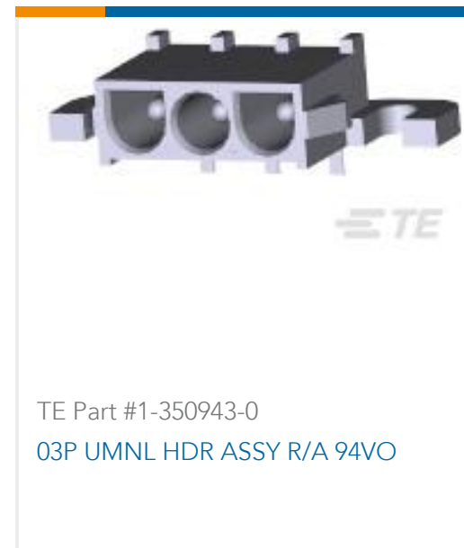
TE Part #1-350943-0 03P UMNL HDR ASSY R/A 94VO