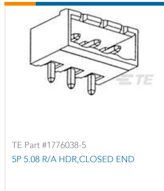
TE Part #1776038-5 5P 5.08 R/A HDR,CLOSED END