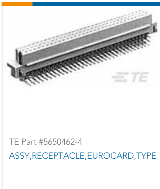
TE Part #5650462-4 ASSY,RECEPTACLE,EUROCARD,TYPE