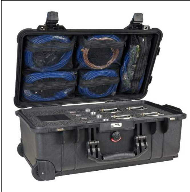
Figure 1. SCS 770051 ESD Event Diagnostic Kit