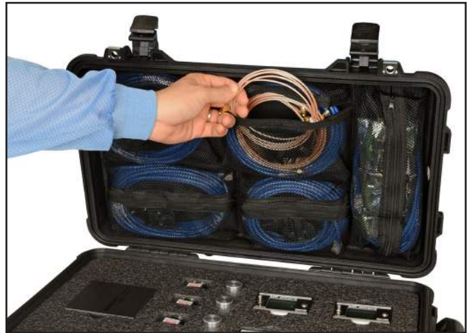
Figure 2. Using the the lid organizer to store accessories

Per ANSI/ESD S20.20 section 6.1.3.1 Compliance Verification Plan Requirement "A Compliance Verification Plan shall be established to ensure the organization's compliance with the requirements of the Plan. Formal audits or certifications shall be conducted in accordance with a Compliance Verification Plan that identifies the requirements to be verified, and the frequency at which those verifications must occur. Test equipment shall be selected to make measurements of appropriate properties of the technical requirements that are incorporated into the ESD program plan."